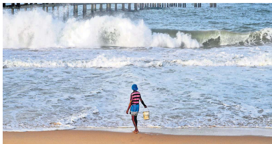
A person stands at Valaiyathura coast in Thiruvananthapuram on Thursday.

"The southwest monsoon has further advanced into the remaining parts of southwest and southeast Arabian Sea, some parts of westcentral and eastcentral Arabian Sea, entire Lakshadweep islands, Kerala and Mahe, some parts of Karnataka and Tamil Nadu, remaining parts of Comorin