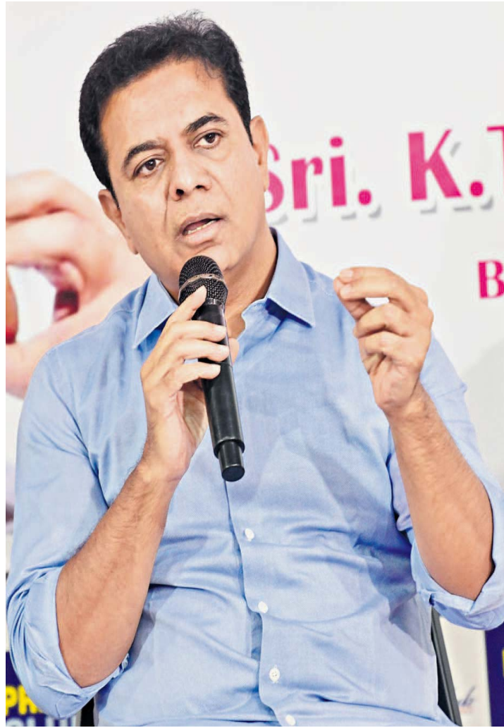
BRS working president KT Rama Rao during Meet the Press programme organised by the Press Club of Hyderabad on Wednesday.

On the Special Intensive Revision (SIR) of electoral rolls, he said the BRS had deployed over 71,000 booth-level activists to monitor the exercise and prevent the deletion of genuine voters. The party was also scrutinising suspected duplicate entries.