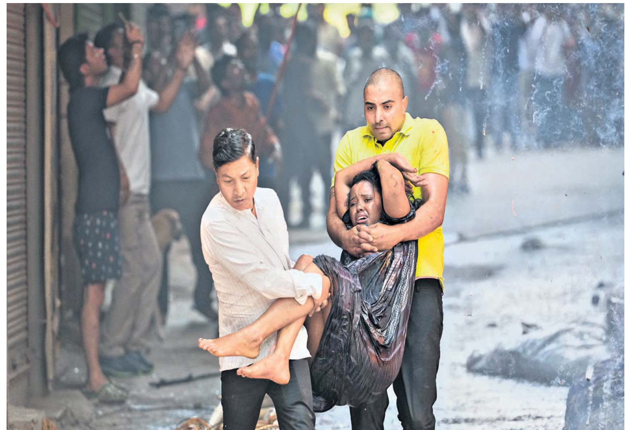
Local people rescue a foreign national from the hotel fire in New Delhi on Wednesday.