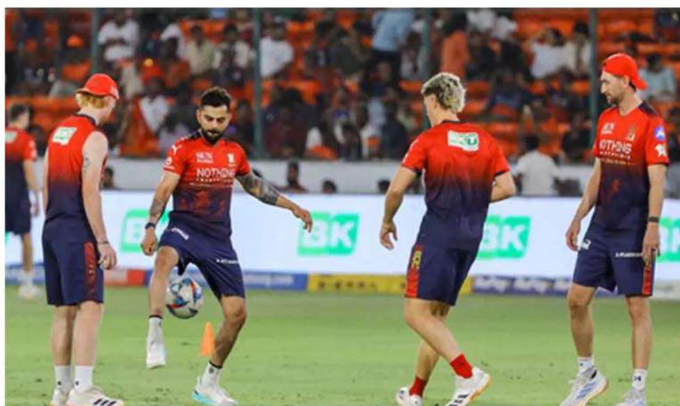
Table-toppers RCB will face 2022 winners Gujarat Titans at the HPCA Stadium in Dharamshala on Tuesday, with the winner set to seal their ticket to the final, to be played at the Narendra Modi Stadium in Ahmedabad on May 31. "RCB have played outstanding cricket this season and, unlike previous years when they were heavily dependent on batting, they are now playing as a team; they look

like a complete side. Their middle order, with players like Tim David, Jitesh Sharma and Rajat Patidar, has added stability and power, which is crucial in T20 cricket. The biggest difference, though, has been their bowling.