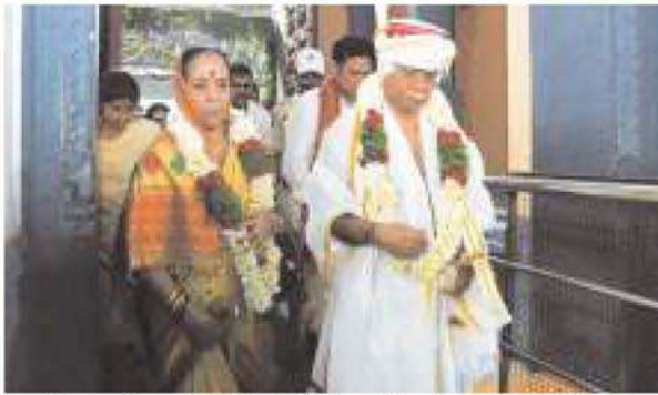
Telangana Governor Shiv Pratap Shukla and his wife praying at the Kaleswar Saraswati Ghat in Kaleshwaram in Jayshankar Bhupalpally district on Thursday