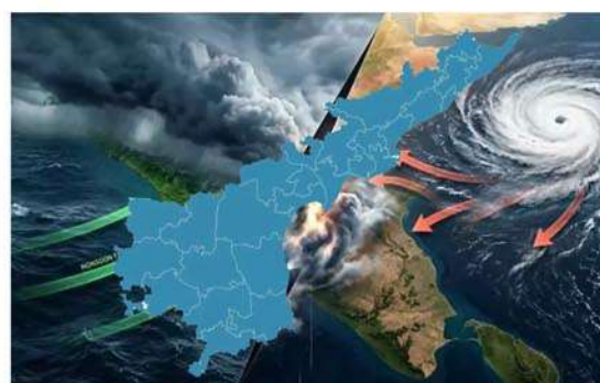
of Bengal—specifically the Northwest, Southwest, and East-Central areas.

wave warnings for Andhra Pradesh, predicting temperatures between 40°C and 45°C in several districts. The department cautioned residents to remain vigilant amid the soaring temperatures. In other weather developments, the Southwest Monsoon is progressing actively. The IMD forecasts that the monsoon is likely to reach Kerala by 26 May. Over the next two to three days, the monsoon is expected to advance into the Northwest Arabian Sea, the Comorin region, and the Bay