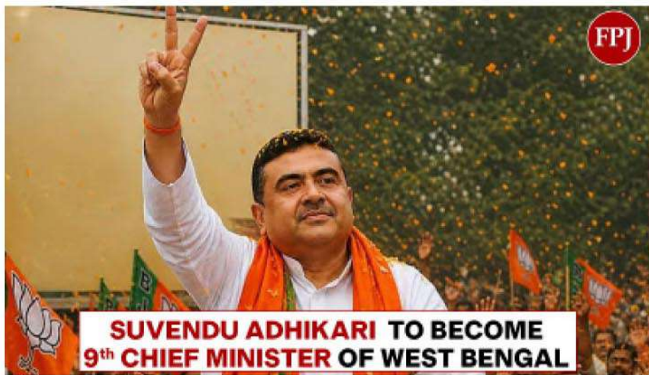
SUVENDU ADHIKARI TO BECOME 9th CHIEF MINISTER OF WEST BENGAL

Suvendu Adhikari, who emerged as a giant slayer not only in the recently concluded West Bengal Assembly elections but also in the previous one, is set to become the ninth Chief Minister of the state after being elected leader of the BJP legislature party on Friday. Suvendu defeated outgoing Chief Minister Mamata Banerjee on both occasions, first in the Nandigram seat in 2021 and this time in the Bhabanipur